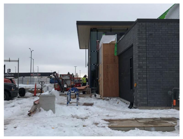
Photo 3. Project delays can push work into winter months, resulting in weather hazards that can further impede job-site productivity.